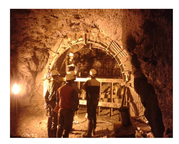
Photograph 3 Treatment of Cavity Zone

Steel ribs were stenghned by channels. During treatment procedure from RD 59.5m to 65m, face collapse was happen four times. The material observed from these zones was sheared in nature with large rock pieces, small fragment of rocks . The main cavity zone was from RD 59.5-65m after that extremely poor rock mass was observed up to the RD 81.5m. The above mentioned sequence was followed based on rock mass material . This is successfully resulted trackling of shear zone and extremely poor rock mass of almost 22m.