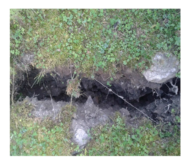
Photograph 2 Surface Cracks above the Cavity Zone

Probe holes of various length was drilled for understanding of rock mass material ahead of the tunnel face. During stabilization process heavy flow of slush was observed. Cement grouting with other support measures were taken for advancement. Some cracks were developed at the surface. Cracks at the surface are shown in the photograph 2.